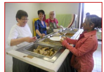
Christ Kitchen Volunteers