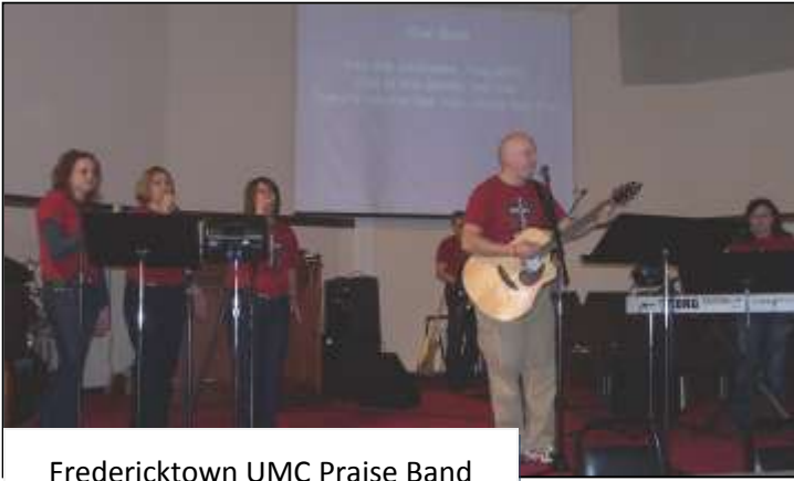
Fredericktown UMC Praise Band