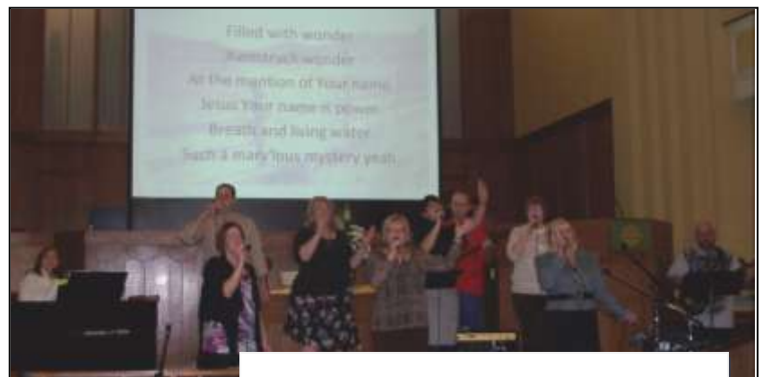
Newcomerstown Christ Praise Band